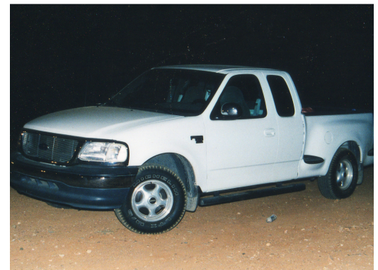
Victim's Truck (recovered)

If you have any information regarding this case you may contact Silent Witness at W-I-T-N-E-S-S, that's 480-948-6377, or toll free at 1-800-343-TIPS. You can also leave an anonymous tip on the silent witness website at silentwitness.org Remember, you remain completely anonymous and could earn a cash-reward for information leading to the arrest and/or indictment of the suspect/s of this crime